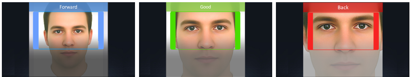
Color visual cues for proper distance positioning

The EF-45NC's TOF sensor detects subjects from over 1.0 meter from the system; the subject's face is immediately displayed on the 5.0-inch high-resolution color display. For proper positioning, the subject will naturally center his face by simply making his or her face fit the positioning "guide box". Vocalized instructions also command the user to move forward or back to get into range. When in the proper range, the guide box and top border turn green, indicating to the subject to stop and wait until the image capture process is completed. Like a smart phone "selfie" image, this interface is highly intuitive, with typical capture and authentication times of 0.5 seconds from proper positioning.